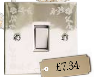
FEMININE FLORALS Patterned one-gang switch plate, Laura Ashley