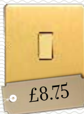
Oxford one-gang two-way rocker in brushed brass, John Lewis