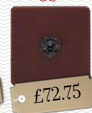
Leather single toggle switch, Turnstyle Design