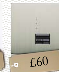
Rania satin nickel digital dimmer, Lutron