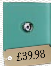
Glass remote-controlled dimmer, B&Q