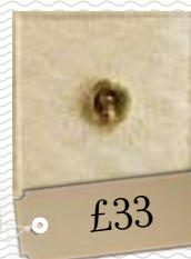
One-gang brass dolly switch with clear plate, Jim Lawrence